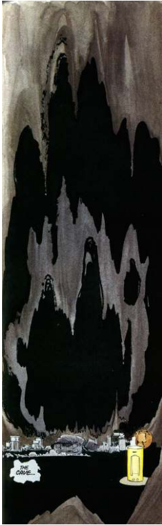
The Batcave (DKR 87)