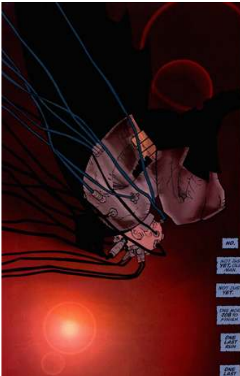
Batman in the fetal position (DK2 198)