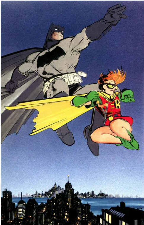
Batman with Carrie (DKR 114)