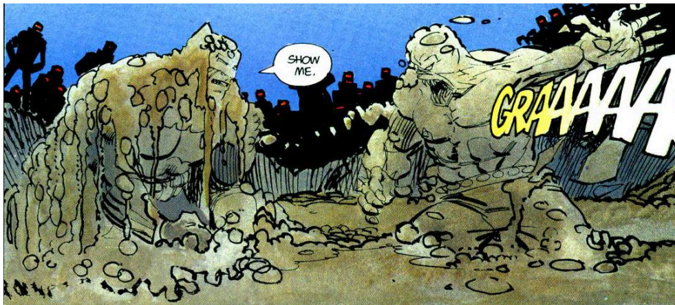
Batman and the Mutant Leader (DKR 99)