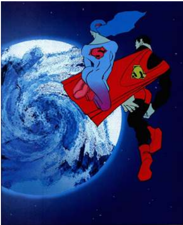
Superman, Lara, and the blue planet (DK2 247)