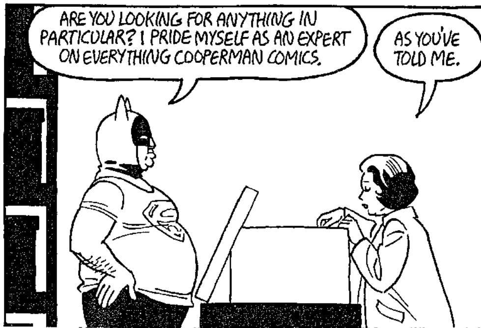
The utopian potential of the superhero is disciplined by mass culture