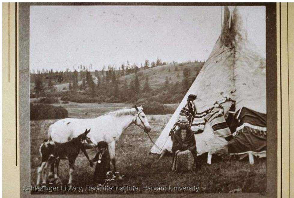
Harvard University, Schlesinger Library on the History of Women in America, 20035986_1

45 In a concluding comment to the female addressee of this letter, Gay tries to place the subaltern position of Euro-American woman in a positive light: "You see, dear E., that civilization has been built up largely upon the altruism of the woman, at the cost of her independence; and is still an expensive luxury to her" (35). The temporal adverb in the final comment—"civilization... is still an expensive luxury" (my emphasis) expresses her indignation and her hope for change. Moreover, Gay implies that civilization is a frivolous "luxury" compared to the more basic necessity of independence. An example of the dialogic nature of the book, this passage echoes the