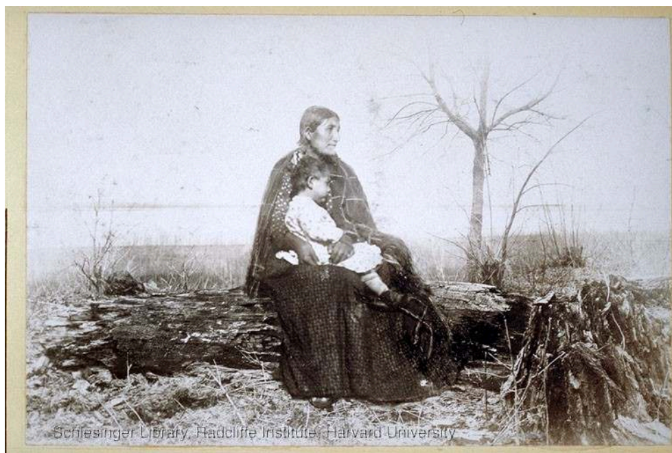
Harvard University, Schlesinger Library on the History of Women in America, 20036065_1

61 Intriguingly, the woman in the book's final photograph, "Retrospect," could be either a Euro-American wrapped in a shawl or an American Indian in a traditional blanket. The image blurs the culturally constructed boundaries between races and genders. As the final image in a book that is partly about place, its location is difficult to pinpoint. The photograph was probably not taken in Idaho. In fact the setting resembles another of the photographs appearing in Choup-nit-ki , entitled "Omaha Madonna" (219) and illustrating the stop the two women made in Nebraska to visit the Omaha and Winnebago in May 1890.