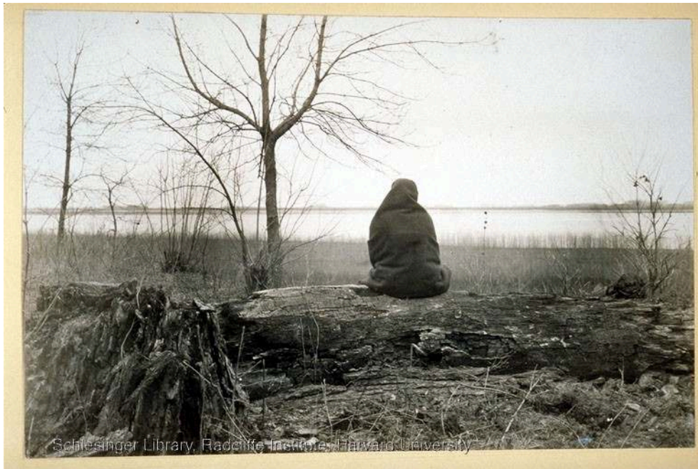
Harvard University, Schlesinger Library on the History of Women in America, 20036573_1

61 Intriguingly, the woman in the book's final photograph, "Retrospect," could be either a Euro-American wrapped in a shawl or an American Indian in a traditional blanket. The image blurs the culturally constructed boundaries between races and genders. As the final image in a book that is partly about place, its location is difficult to pinpoint. The photograph was probably not taken in Idaho. In fact the setting resembles another of the photographs appearing in Choup-nit-ki , entitled "Omaha Madonna" (219) and illustrating the stop the two women made in Nebraska to visit the Omaha and Winnebago in May 1890.